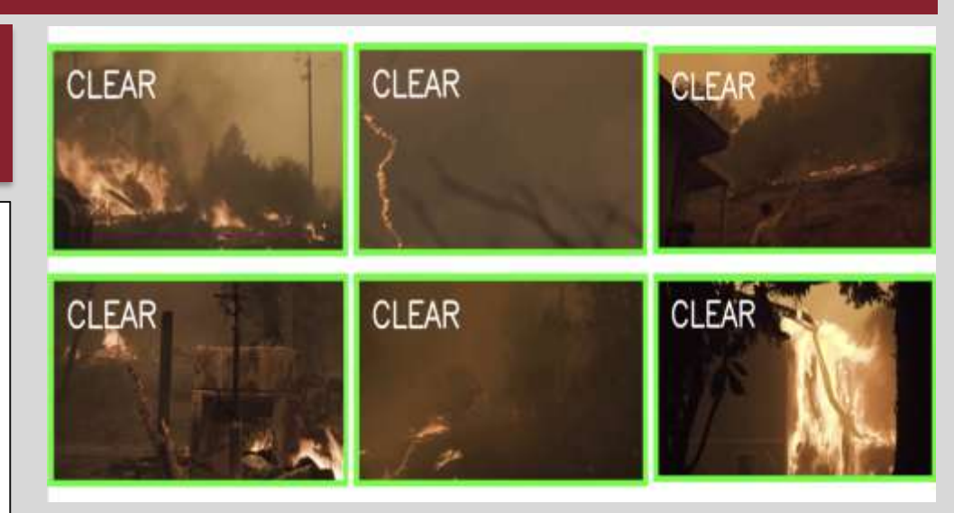
Figure 5: Original inaccurate wildfire detection results