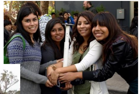
Teacher Professional Development