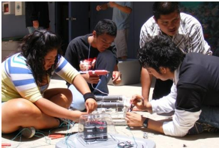
Student Academic Development in STEM