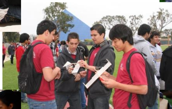
Parent Education and Involvement